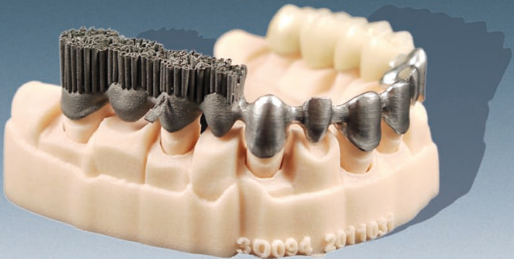
Laser-sintered dental prosthesis (with support structures; surface ready for veneering; after veneering) on laser-sintered dental model with identification tag.