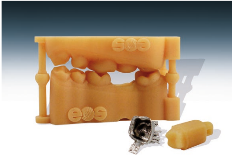
Dental model laser-sintered on the FORMIGA P 100 and corresponding crown produced using the EOSINT M 270.

Digitally assessing the patient's oral situation eliminates the need for a time-consuming production of a plaster model. However, a model is still required for finishing work, occlusion adaptation or other applications in orthodontics. This is where polymer laser-sintering comes into play, permitting you to close this gap. By using digital three dimensional data, the FORMIGA P 100 produces a plastic model that is used both for checking prosthesis quality and for veneering and production of the dental prosthesis. Moreover it is possible to generate models for analysis.