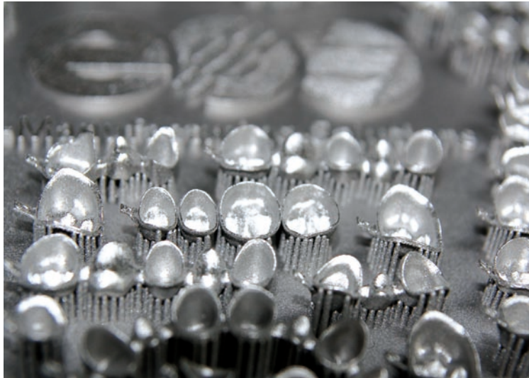
Dental platform with copings laser-sintered on EOSINT M 270.

Using the conventional casting production process, a dental technician can currently produce about 20 dental frames per day. Using e-Manufacturing with laser-sintering, however, it is possible to produce approximately 450 high-quality units of crowns and bridges within 24 hours. This corresponds to a production speed of approximately three minutes per unit on average. The technological centerpiece of this is the EOSINT M 270 – the only system of its kind that produces cost-effective, high-quality dental prostheses using Direct Metal Laser-Sintering (DMLS). In order to be able to manufacture dental prostheses using this additive layer manufacturing method, the 3D-CAD data is sliced into layers. Using these as a model, the desired geometry is produced in layers by selectively fusing cobalt chromium powder using a laser.